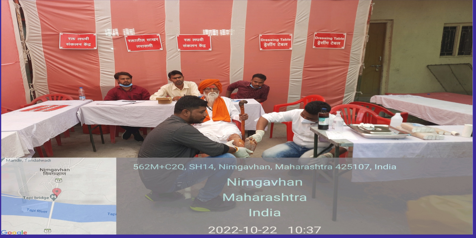
Facility of Dressing for Patient.