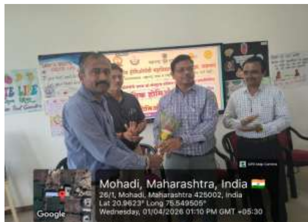
Felicitation of Chief Guest